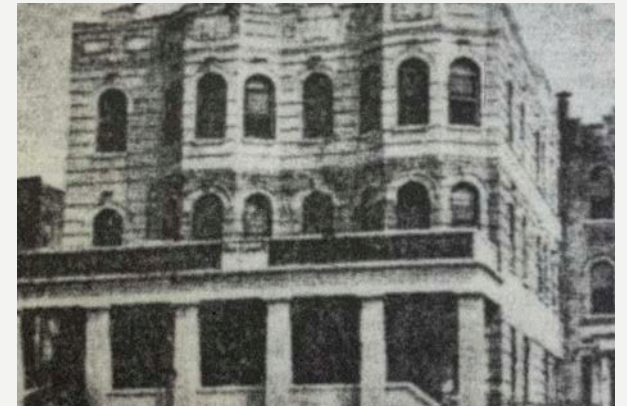
Yeshivas Chaim Berlin no Prospect Place