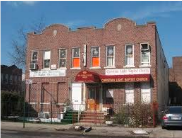
Young Israel of Brownsville