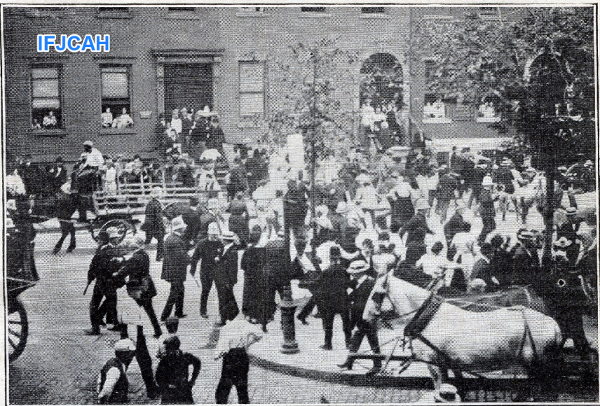
These ruffians attacked the mourners at the funeral of a Rabbi, and left 200 wounded on the field