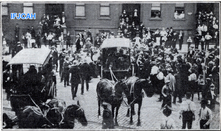
Here are the ambulances carrying away the unfortunate 200