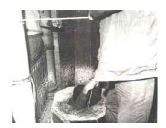
11) Pictures taken by Michal Arbel, 1968